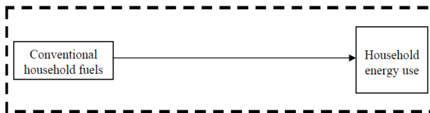
Figure B.4.1: Baseline emissions. Sources of GHG emissions and uses