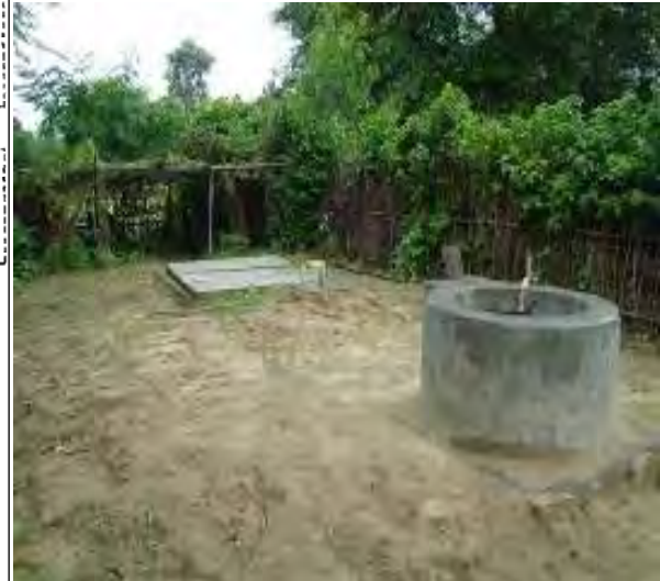
Fig: Biogas Digester in Operation